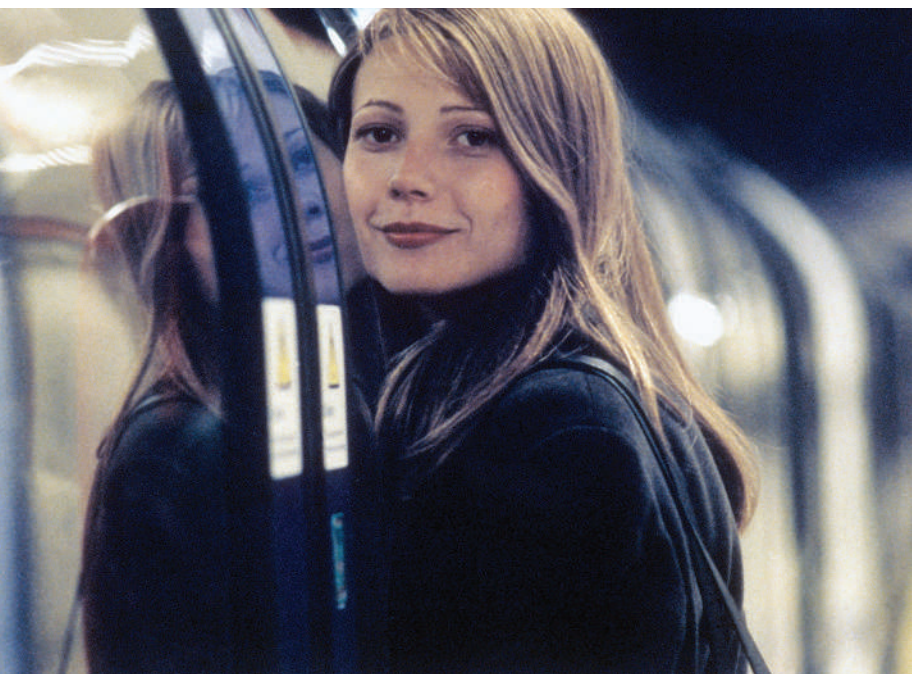
Is it only in fiction that we can experience parallel lives? If atoms can be in two places at once, so can you.

Everett's theory is simple to state but has complex consequences, including parallel universes. The theory can be summed up by saying that the Schrödinger equation applies